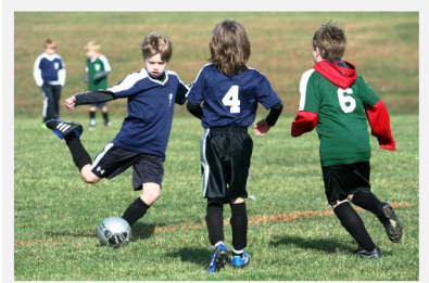
Central Carroll soccer program

Carroll County Department of Recreation and Parks